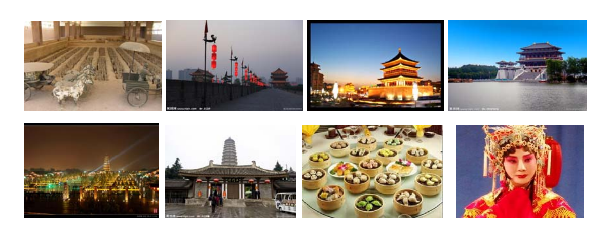
More details please refer to the web

Xi'an is also a tourist city. The city witnessed many major events in China's history. Every brick, every object unearthed in that historic city can tell us a fascinating story. The Shaanxi history museum there has a collection of over 370000 items. You cannot miss it.